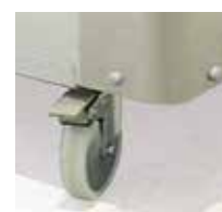
NYLON WHEELS FOR MOBILITY.