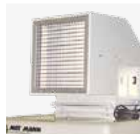
DOUBLE-DEFLECTION GRILLS ON THE FRESC MANN MODEL.