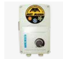
PANEL DE CONTROL FRONTAL DE FRONT CONTROL PANEL, 1-SPEED OR VARIABLE FLOW.