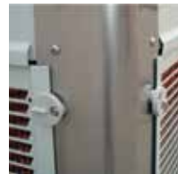
QUICK-OPENING APERTURES WITH HALF-TURN KNOB.