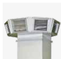
8-DIRECTION AIR DIFFUSER WITH SINGLE-DEFLECTION GRILLS ON THE BRIS MANN MODEL.