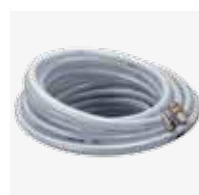
QUICK-CONNECT HOSE FOR CONNECTION TO WATER SOURCE.