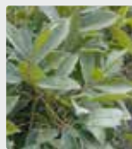
Plants and gardens