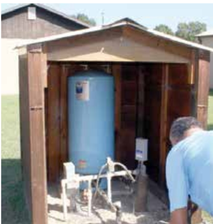
Home well water system