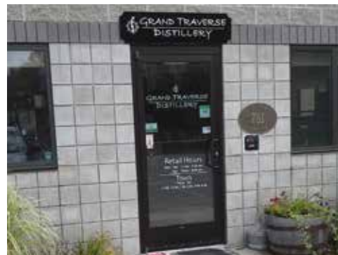
Grand Traverse Distillery