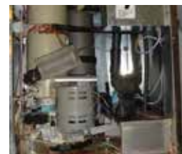
Vulcan protecting the ice machine