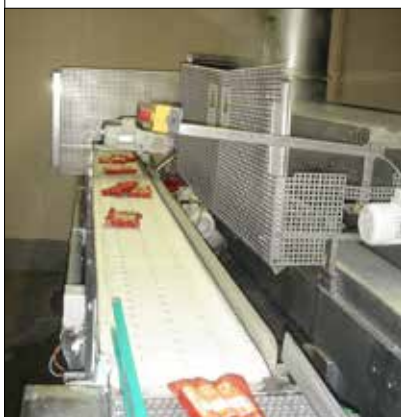
Sausage packaging line