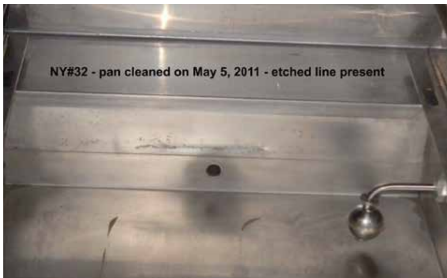
After Vulcan installation - pan area is now completely scale free