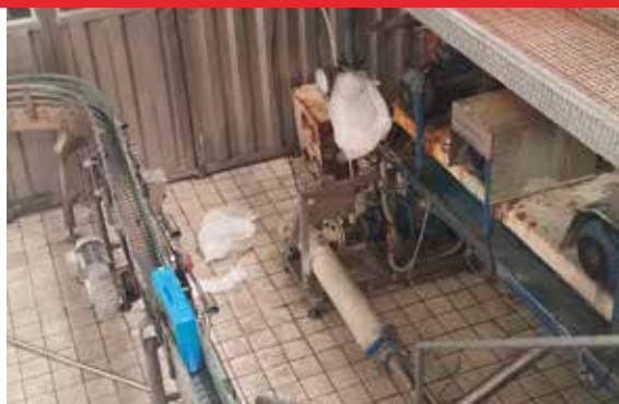
The Coca-Cola factory in Marrakech, Morocco