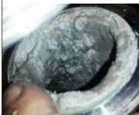
Before Vulcan installation: the pipe was full of scale deposits.