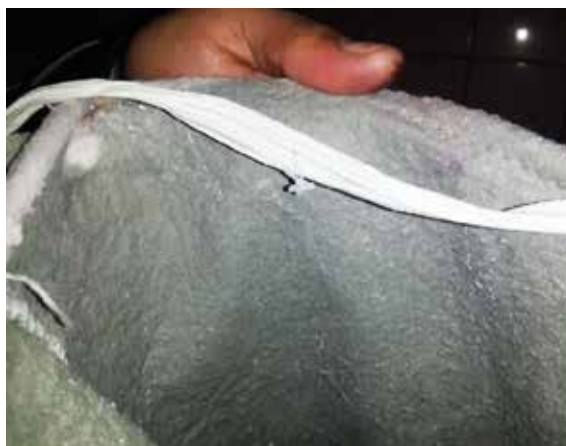
48 hours after Vulcan was installed, the filter still stays clean.