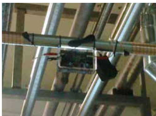
Vulcan 3000 installed in the Delice Danone factory