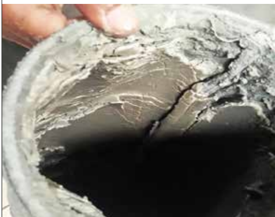
Without Vulcan, the filter was quickly stuck by scale deposits, and it had to be changed every 48 hours.