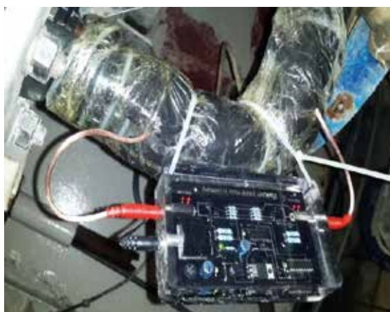
Vulcan 5000 was installed on the water inlet of the water recycling room.