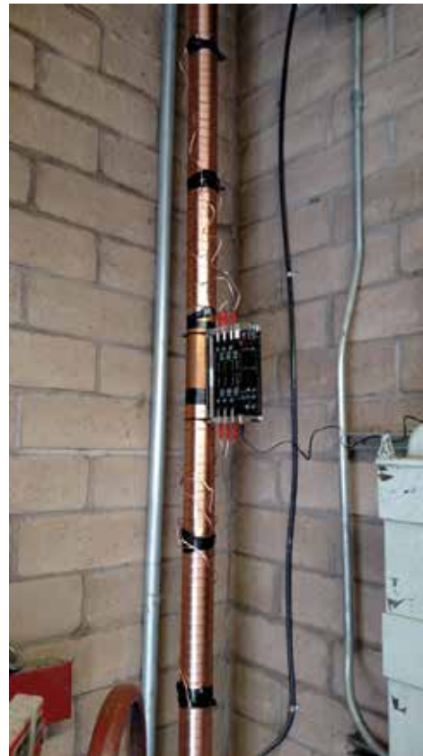
Vulcan S100 installed on the main water line