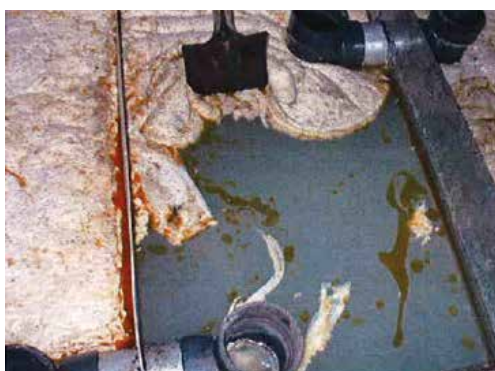
Before Vulcan installation