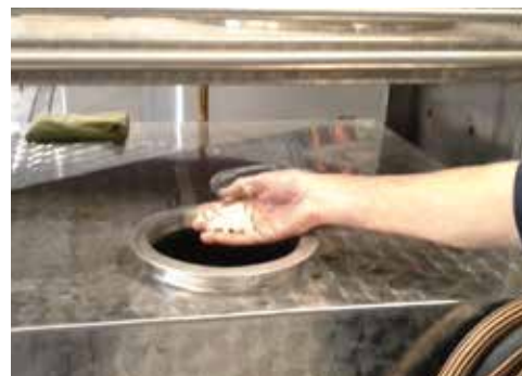
Scale deposits removed after installing the Vulcan 3000