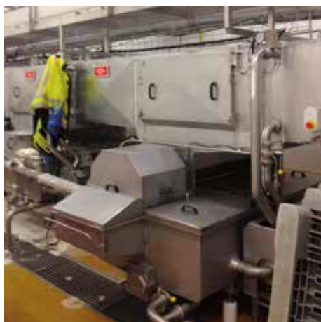
Washing machine used for the white containers

Before installing the Vulcan unit, the scanning machine could not read barcodes due to scale incrustations. Now after installed Vulcan, the machine is able to read these bar codes correctly. Bigard is now saving on maintenance costs and reduced time spent on cleaning the washing machine and white boxes.