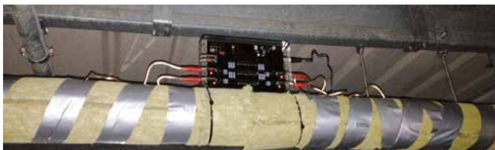
Vulcan S25 unit installed with insulation re-wrapped over the pipes and impulse cables