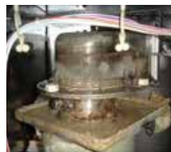
Vulcan protecting the ice-cream makers