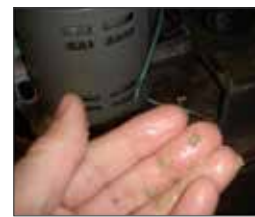
Soft limescale is now easily removed