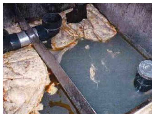
3 months after installation - grease is more consistent and less cluttering