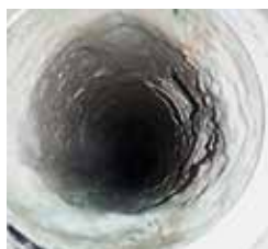
2 weeks after Vulcan was installed, scale had been softer and fallen out.