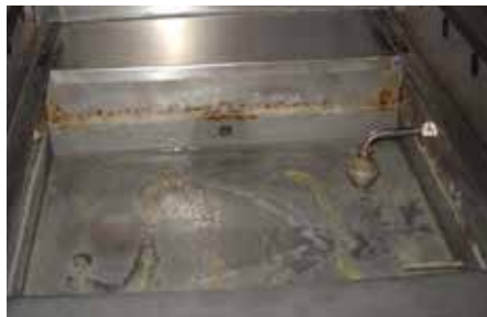
Before Vulcan installation - hard scale build up in the pan area