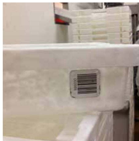
White containers and barcodes are now free of scale