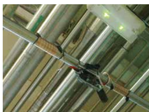
Vulcan 3000 installed in the Delice Danone factory