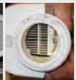
Swimming pool filter